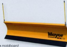
Drive Pro moldboard

Upgrade to one of these Pro Series plows: