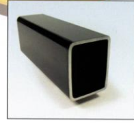
The pivot bar is constructed using heavy walled tubular steel for added strength and rigidity.