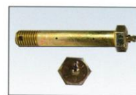
Pro Series plows utilize a larger king bolt that is 41% stronger and can withstand a load 2.4 times greater. Features easy-to-reach grease fitting for longer service life.